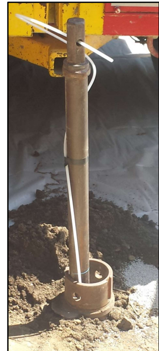
Figure 1 - Mini Probe deployed in hollow stem augur.