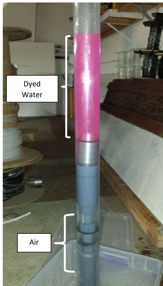
Figure 2- Rhodamine dye showing the seal of a 2" Retro ZIST system in a clear PVC pipe. NOTE: The space beneath the flanges is not filled with water, but with air, representing a high pressure differential.

Water level measurements are simply accommodated. The pump is lifted up a few inches off the docking station allowing groundwater within the well screen to communicate with the atmosphere and adjust to hydrostatic pressure over time. The tubing slack (from the slightly lifted pump) is attached via a tubing clip located on the underside of the well suspension cap. When the operator opens the well, the first task typically is to obtain a water level measurement. The pump is then reset into the conical docking station by lowering it a few inches until it seats – thereby allowing the well screen section to be purged and sampled.