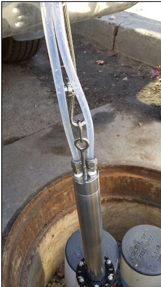
Figure 2- Stainless Steel Panacea P200 being deployed into a nested monitoring well in North Hollywood, CA. Tubing is 3/8" OD FEP bundled with 3/16" stainless steel support cable. The docking cage is located at the bottom of the photo.

From 2012 to 2014, one hundred Panacea Pumps in 25 nested wells built with Inline ZIST were installed as part of the Groundwater System Improvement Study (GSIS) through the Los Angeles Department of Water and Power. Trichloroethylene (TCE) and tetrachloroethylene (PCE) contamination had threatened regional groundwater supplies, even requiring the deactivation of several water supply wells. The ZIST wells were used to help fully determine the extent of contamination to study treatment options and to gather annual data on water quality. Wells were located on the sidewalk or in the parking lane in the street, limiting space for storing purge water. Deep zone pump depths were in the range of 700 – 800 ft. bgs, with water levels ranging from 250 – 350 ft. bgs. Because the Inline ZIST system was able to completely isolate the screened section from the rest of the casing, purge volumes required prior to sampling were reduced on these deep wells by a factor of more than 10 times!